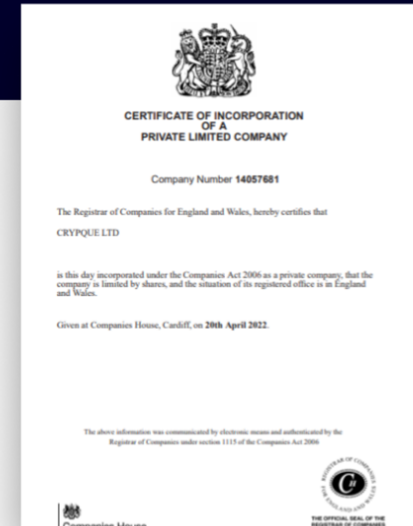
CRYPQUE LTD UK, LONDON