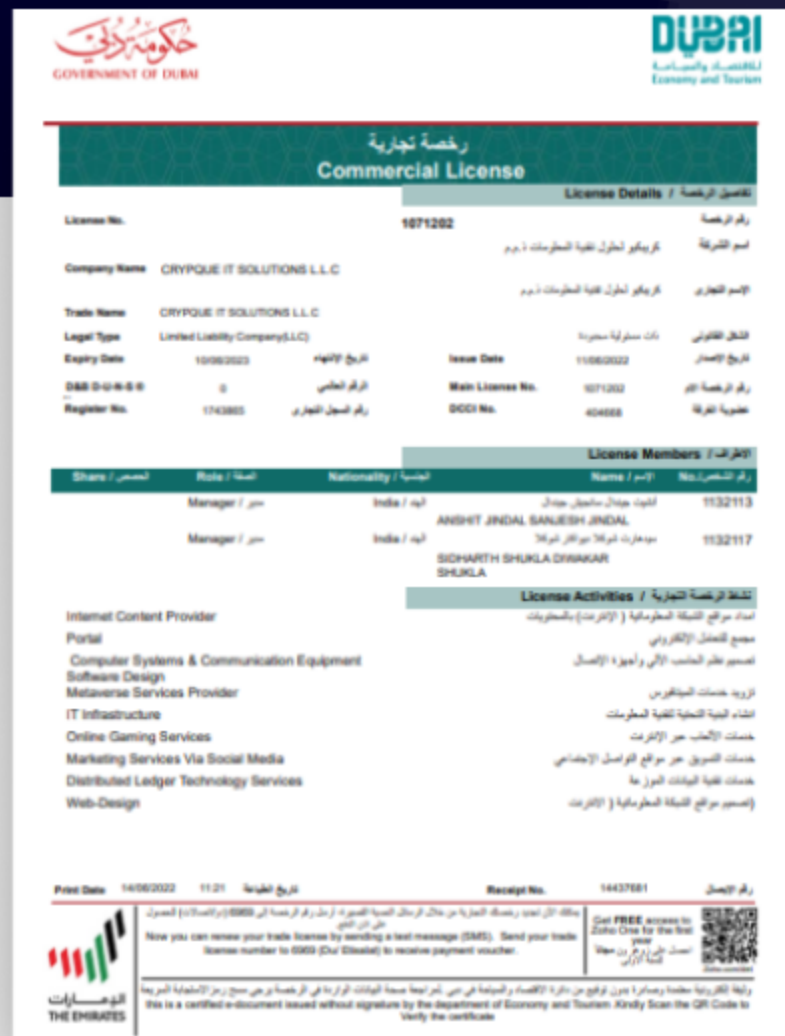
CRYPQUE IT SOLUTIONS LLC DUBAI, AMAN EMIRATES