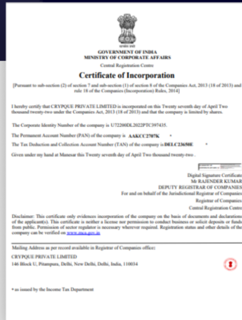
CRYPQUE PRIVATE LIMITED GURGAON, MUMBAI, KOLKATA INDIA